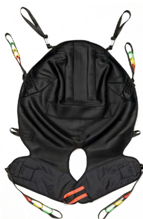
Deluxe Spacer Sling with Head Support