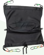
Comfort Spacer Sling without Head Support