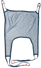
Classic Low Sling