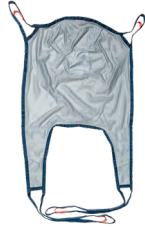
Classic Sling with Head Support