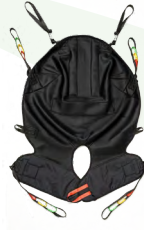
Deluxe Spacer Sling with Head Support